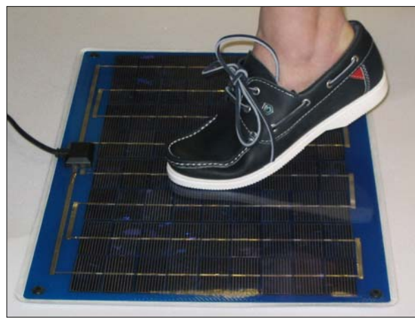
Spectra panels are tough enough to walk

The new Spectra range of solar panels are ideal for maintaining and replacing natural discharge in 12V deep cycle batteries in leisure applications. In wintertime you can avoid the trouble of taking batteries home for topping up by installing one of the Spectra range of 5Watt, 10Watt or 20Watt solar panels. In the UK we recommend a minimum ratio of a 10W solar panel to a 100Ah battery, daily this would generate up to 3Ah. In summertime this increases up to a potential of 21Ah daily, typically enough for a summer weekend's cruising needs for basic lighting etc. Most importantly you'll arrive to a battery that is not flat!